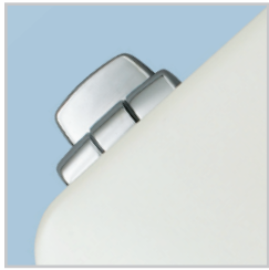
METAL WHISPER•CLOSE® HINGES