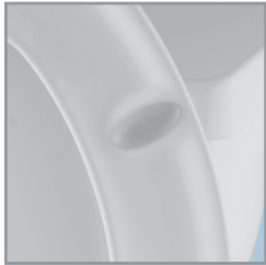
NO-SLIP LUXURY BUMPERS