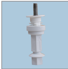
STA-TITE® SEAT FASTENING SYSTEM™